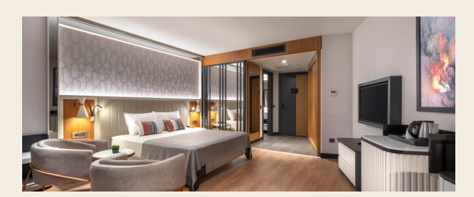
35 m<sup>2</sup> 1 double bed