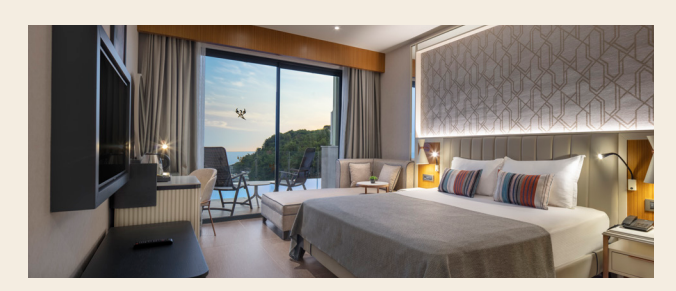
33-40 m<sup>2</sup> double bed + 1 single bed or / 1 double bed