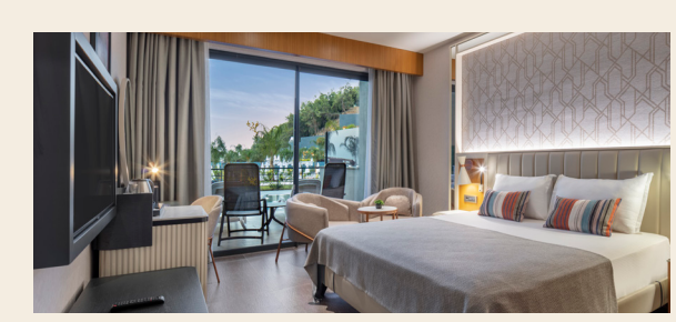
50 m<sup>2</sup> 1 double bed + 2 single beds